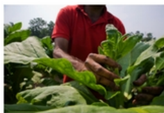
Farm workers pick the tobacco leaves

Because farmworkers are excluded from many federal labor laws passed in the 1930s, farmworkers aren't guaranteed freedom of association or the right to collectively bargain. Fear of retaliation and blacklisting leaves farmworkers in a dangerous and precarious situation that discourages them from speaking out against abuse and exploitation. Until workers have a voice in their workplace, these abuses will continue.