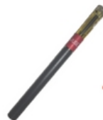
Reynolds extracts the nicotine, converts it to a liquid and inserts it into VUSE e-cigarettes