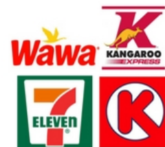
Convenience stores sell VUSE e-cigarettes to consumers across the US