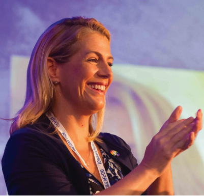
62nd Annual Convention