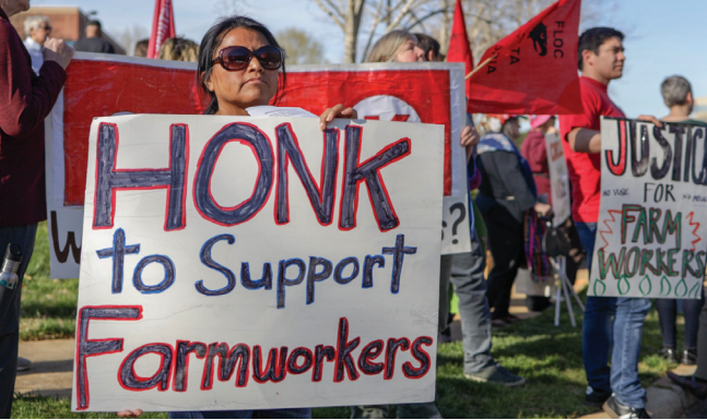
FLOC Boycott Vuse Action