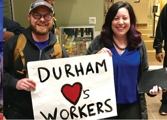
Durham Workers' Rights Commission

Democratic municipal officials from around the state to discuss policies to help grow the labor movement.