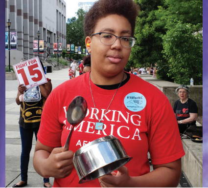
Pots & Spoons Protest