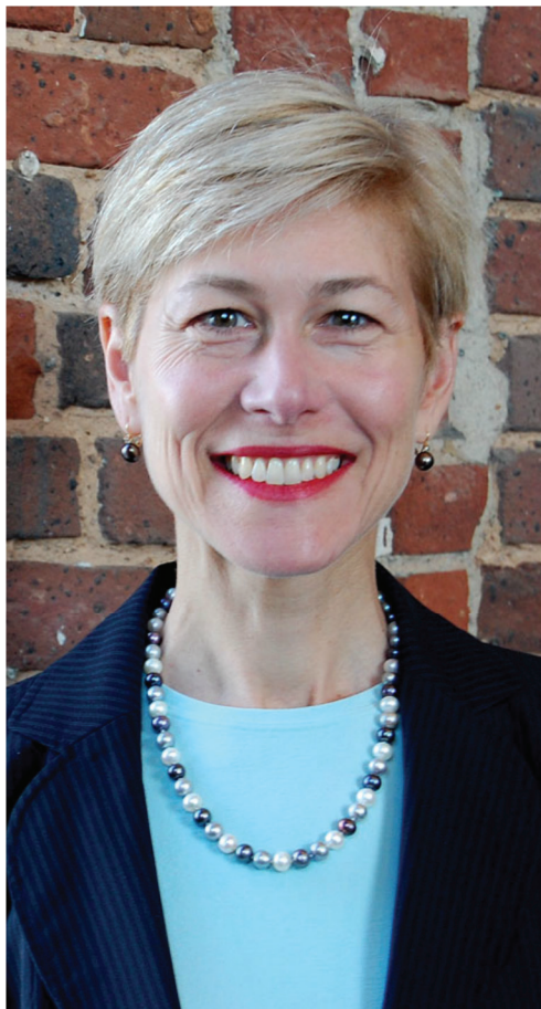
Deborah Ross U.S. Senate