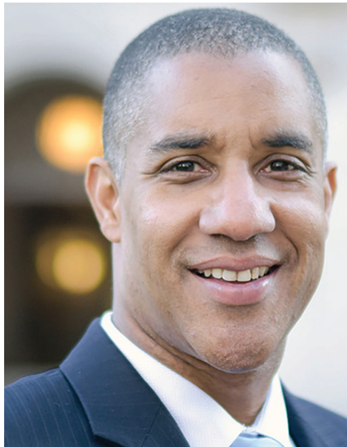
Dan Blue III State Treasurer